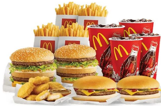
Figure 6. McDonald's Dinner Box promotion offers, https://www.businessinsider.com/mcdonalds-dinner-box-strategy-2014-6