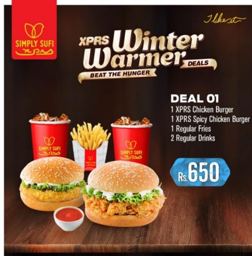
Figure 5. Simply Sufi XPRS - Serve Pakistan, https://servepak.com/2213-simply-sufi-xprs/