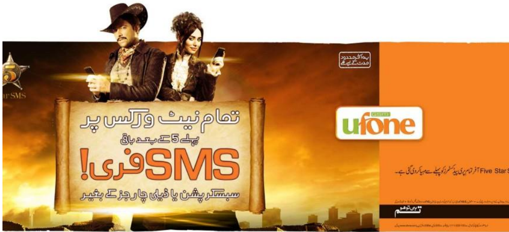
Figure I3. Ufone advertisement, https://insider.pk/entertainment/tv/pakistani-advertisements-best/