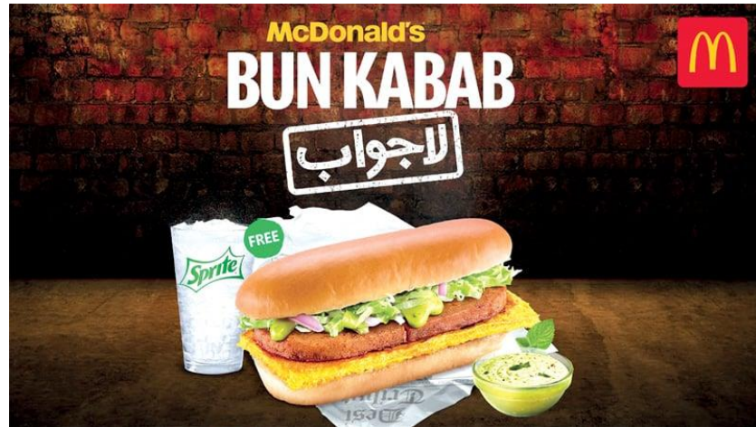
Figure 2. McDonald's Pakistan introduced its native product Bun Kabab on 1 April 2019, https://aurora.dawn.com/news/1143497

advertised digitally-led through visual communication campaigns and print media. This is an example of an international brand focusing on cultural foods (see figure 2). 5