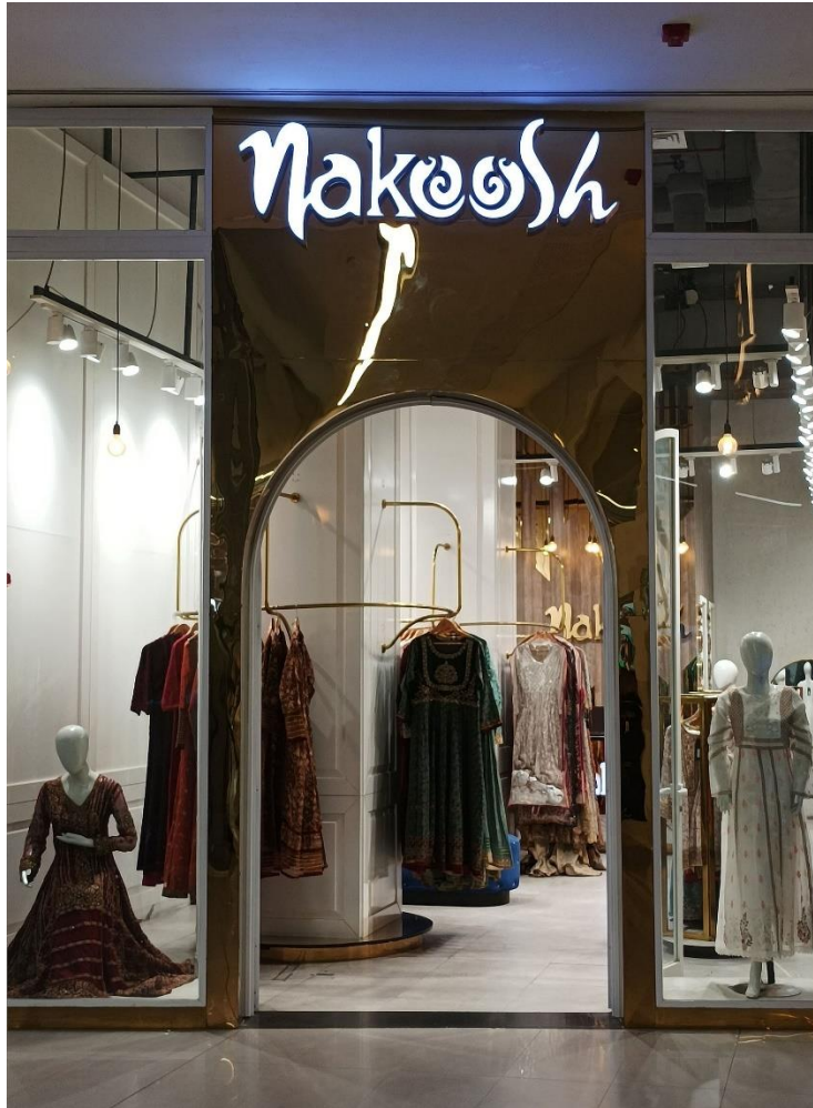
Figure 16. Naqoosh lady's boutique, Emporium Mall Lahore, photograph, 12, June 2023.