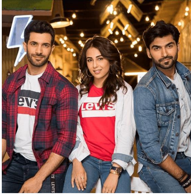
Figure 10. Levi's an American clothing retail brand, https://www.brandedgirls.com/international-brands-in-pakistan-list/