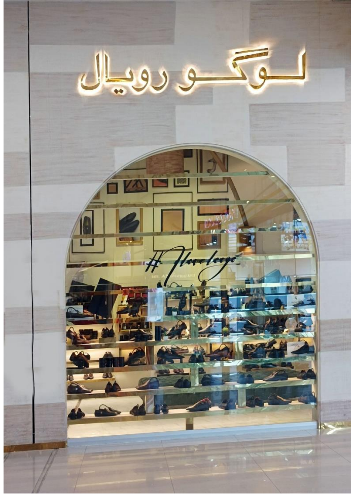
Figure 15. Logo Royale men's footwear manufacturer, Emporium Mall Lahore, photograph, 12, June 2023.