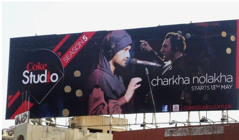
Figure 4. Coke Studio Season 5 Billboard advertisement, the image of Umair Jaswal, https://www.jamhoor.org/read/2020/2/24/mystics-mullahs-and-markets-in-post-911-pakistan