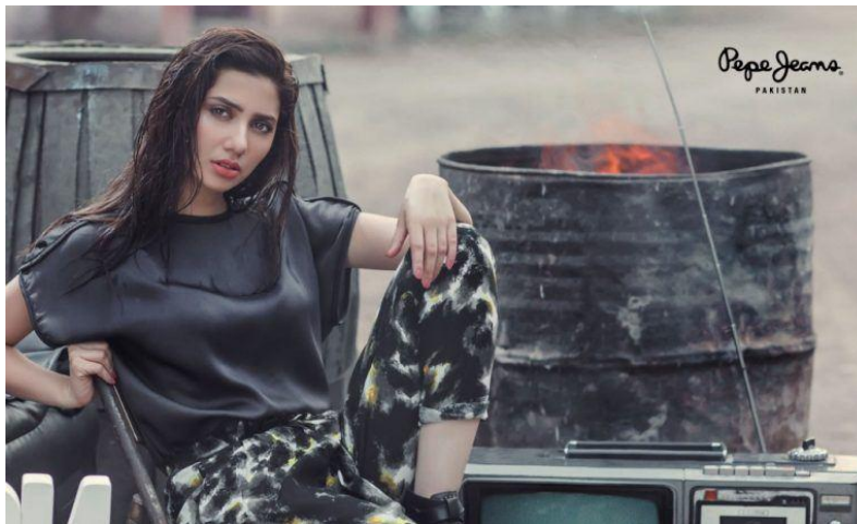
Figure 9. Pepe Jeans casual wear brand, https://www.brandedgirls.com/international-brands-in-pakistan-list/

particularly western styles. The example here presents a female model sitting between unrelated male models (see figure 10). The visual is not a considerable presentation according to Muslim values. The customers are communicated through visuals promoting femininity as appreciated in the West. The traditional approach in this situation is considered to oppose women's rights. The Muslim societies are concerned over these revolutionary images where patriarchy is dominating. The Western mimicry through such visuals represents the postcolonial approaches in communication design. The postcolonial Pakistani advertisements of brands are negotiating with Western styles. The advertisements of brands are mimicking West. The advertisers and consumers are living in a loss of identity.