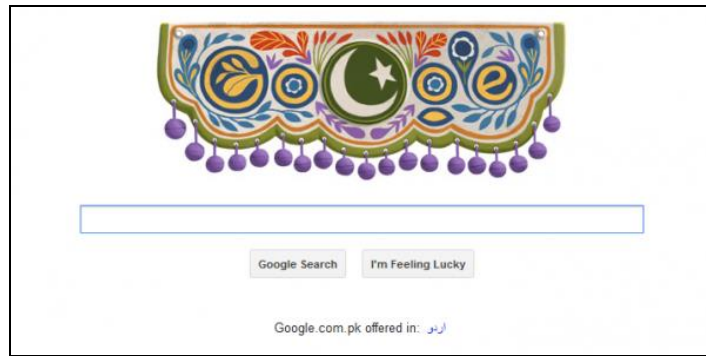
Figure 3. Google Doodle showcases Pakistani culture ‘Truck Art’ 14 August 2012, Artists Revealed, http://www.meanwhileinpakistan.com/2015/10/google-doodles-for-pakistan/