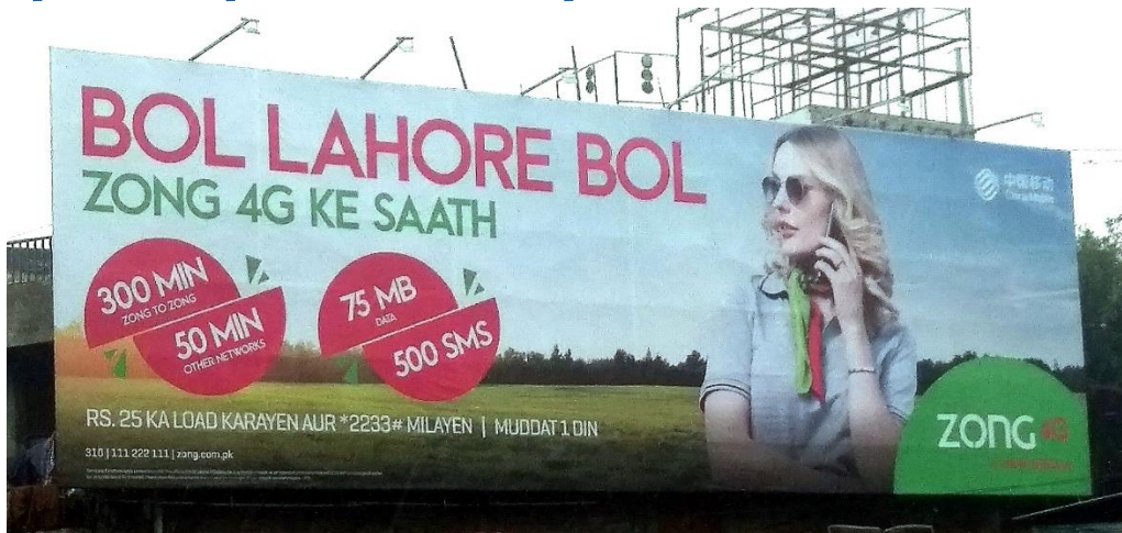
Figure 14. Zong 4G Billboard, Chauburji Chowk Lahore, photograph, 27, December 2020.