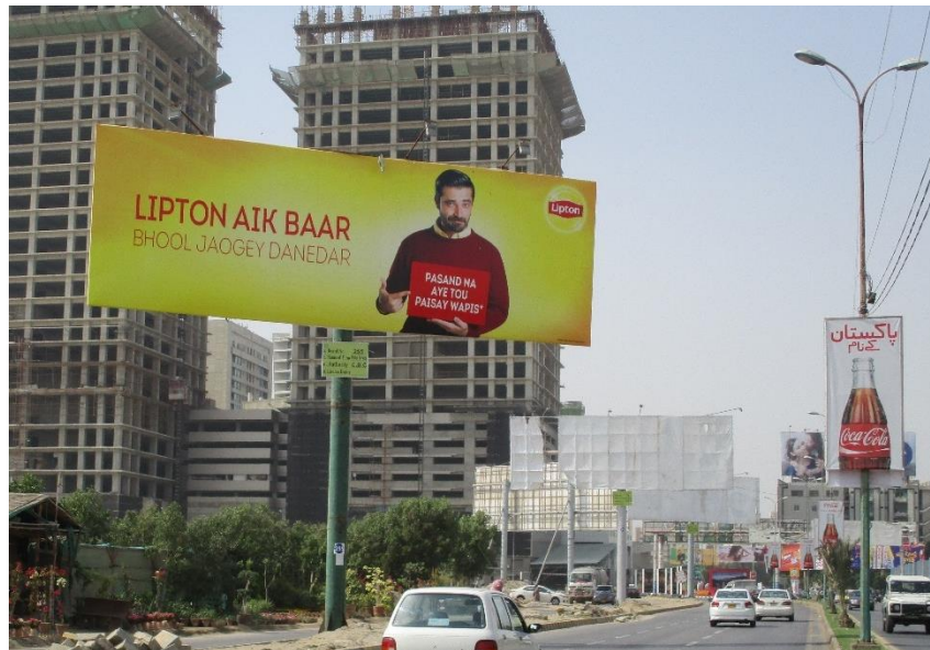
Figure I2. Lipton Tea Billboard

language across the country. The visual communication designs use Roman script for Urdu tag lines. The reason for the Roman alphabet adaptation is due to the lack of skills in Urdu typing software. The brands in Pakistan prefer Roman script as Urdu fonts are less readable for communication designs. Urdu script is also avoided to keep away the local appeal to the brand. The film industry of Bollywood and Lollywood use Urdu written in Roman script. The communication for both the Devanagari and Perso-Arabic names of the films is achieved. The Roman script for Urdu evolved through technology as the software of Urdu was not sufficient. The daily communication on smartphones and social media uses Roman script for Urdu composing. The spelling of the words differs according to the tagline communication requirements for the brand (see figures I2-I6).